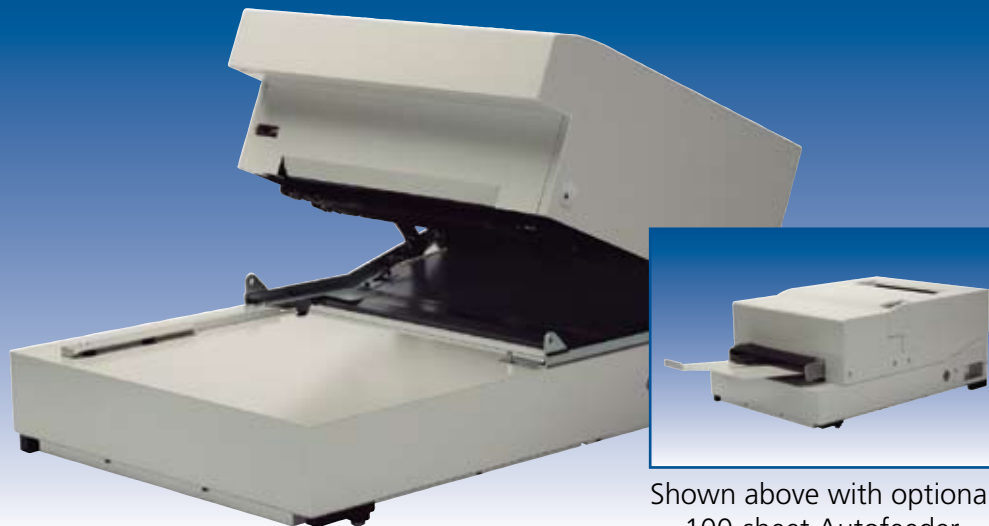
Shown above with optional 100-sheet Autofeeder