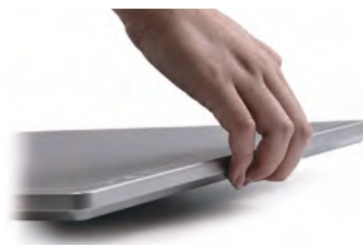
SIDE CHAMFER to ease your lifting