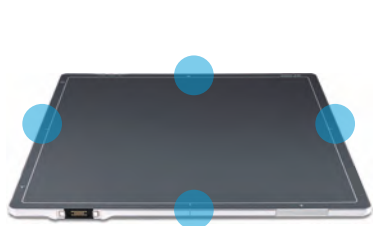
CENTER-ENGRAVING to help position the patient

User-centric design of the detector support patient positioning and alleviate daily burdens.