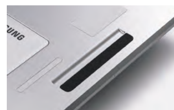
REAR GRIP to support transportation