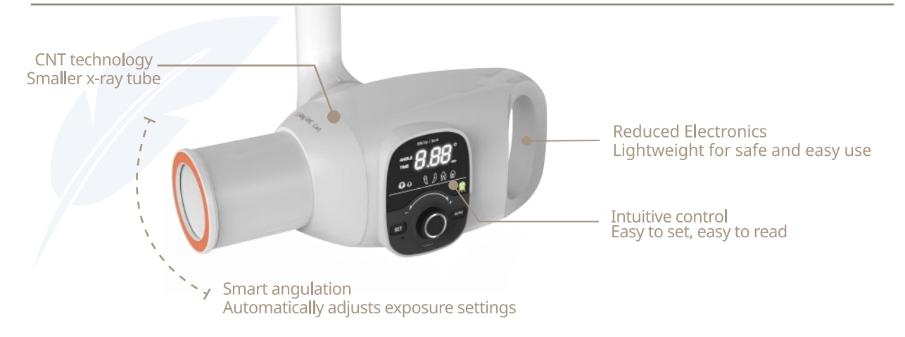
The 5.6 lbs lightweight tube head makes it easy to handle and position, producing a faster workflow.