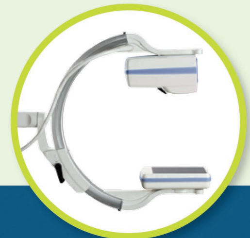
20" (50.6 cm) arch depth & thin profile for table-top positioning.