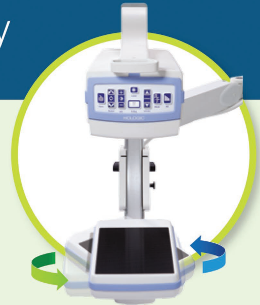
Flat detector rotation is an industry exclusive from Hologic.